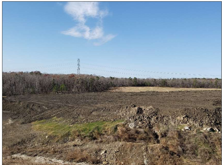
Photo No. 8 Looking west at active working area in Cell 4.

Looking northeast at the west slope of Cell 3.