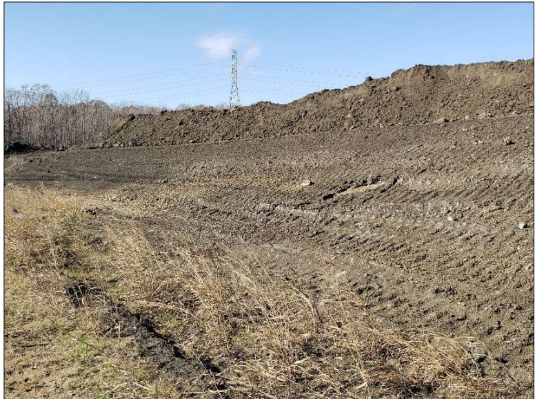
Photo No. 5 Looking northwest at southern slope of Cell 4.

Looking east at the south slope of Cell 2.