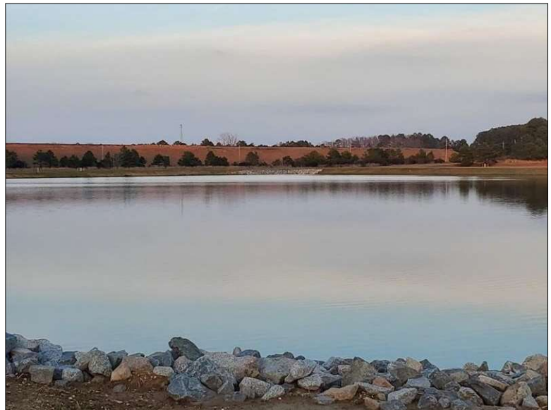
Photo No. 2 Looking across Recycle Pond A from the southwest corner to the northeast corner.

Looking at the southeast corner of Recycle Pond A where the south dike was breached during closure construction to the Clear Water Holding Pond.